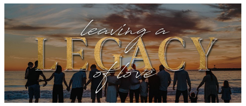
What You See Is What You Get January 7 & 8, 2023